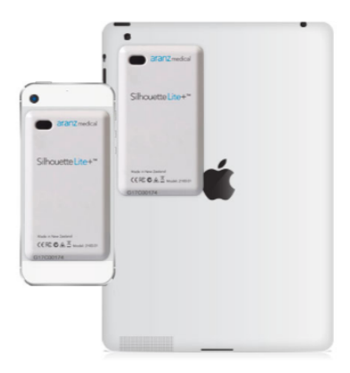
The SilhouetteLite+ sensor attaches to the back of mobile devices, enabling accurate and consistent 2D measurements and images.