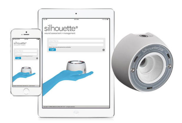
Silhouette is available for use across a range of end user devices (iPhones, iPads, and SilhouetteStar 3D cameras) to meet the needs of different users.