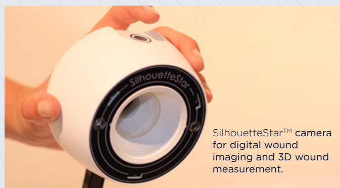
SilhouetteStar™ camera for digital wound imaging and 3D wound measurement.

The system allows the Kings Diabetic Foot Clinic team to assess and monitor, much more effectively than traditional methods, the progress of Diabetic Foot Ulcers.